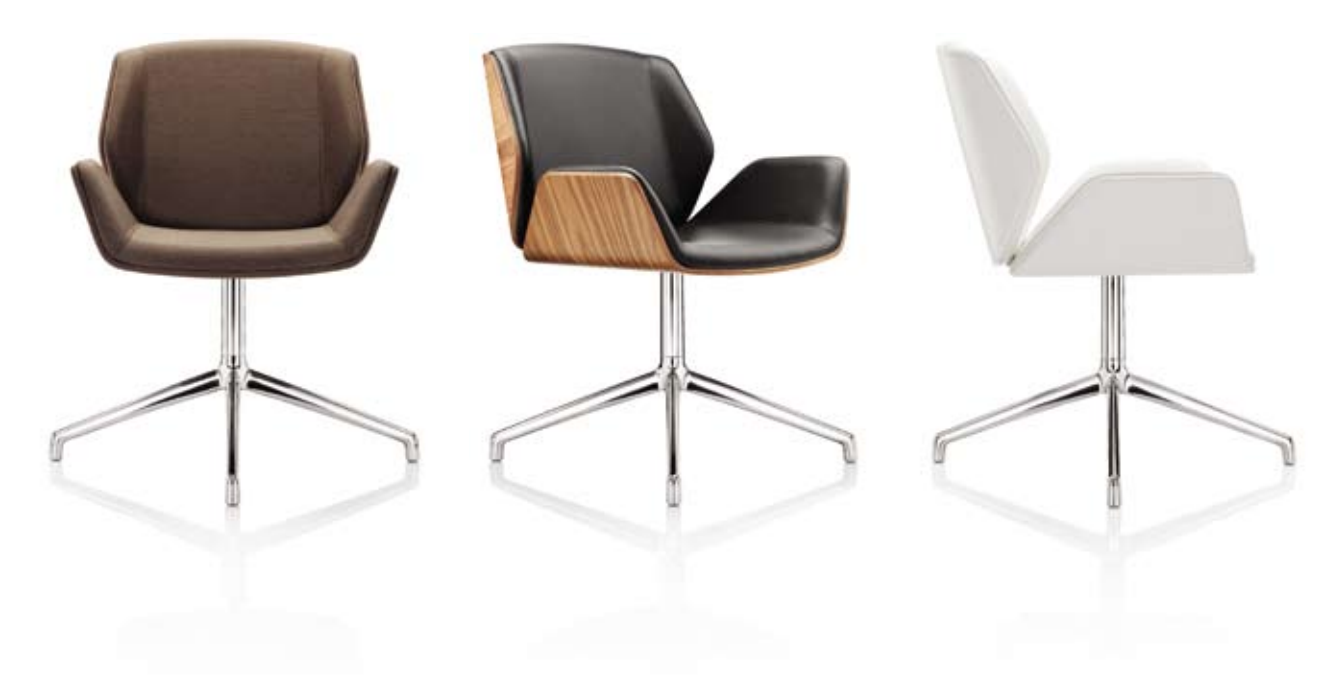
Fully upholstered in Designtex fabric