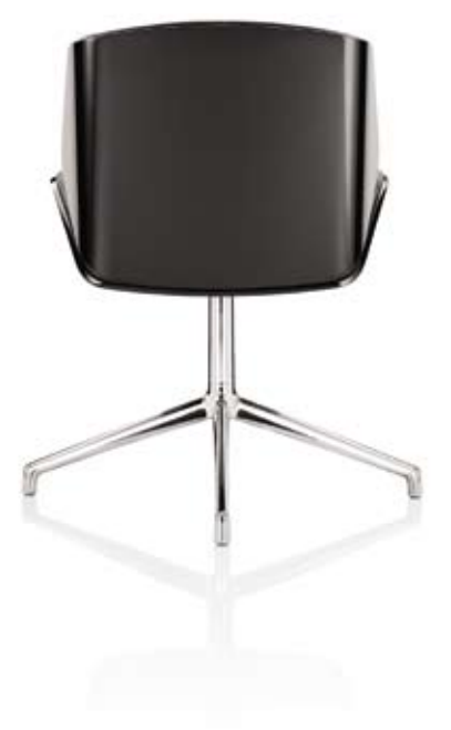
High-gloss polyurethane lacquer with leather interior