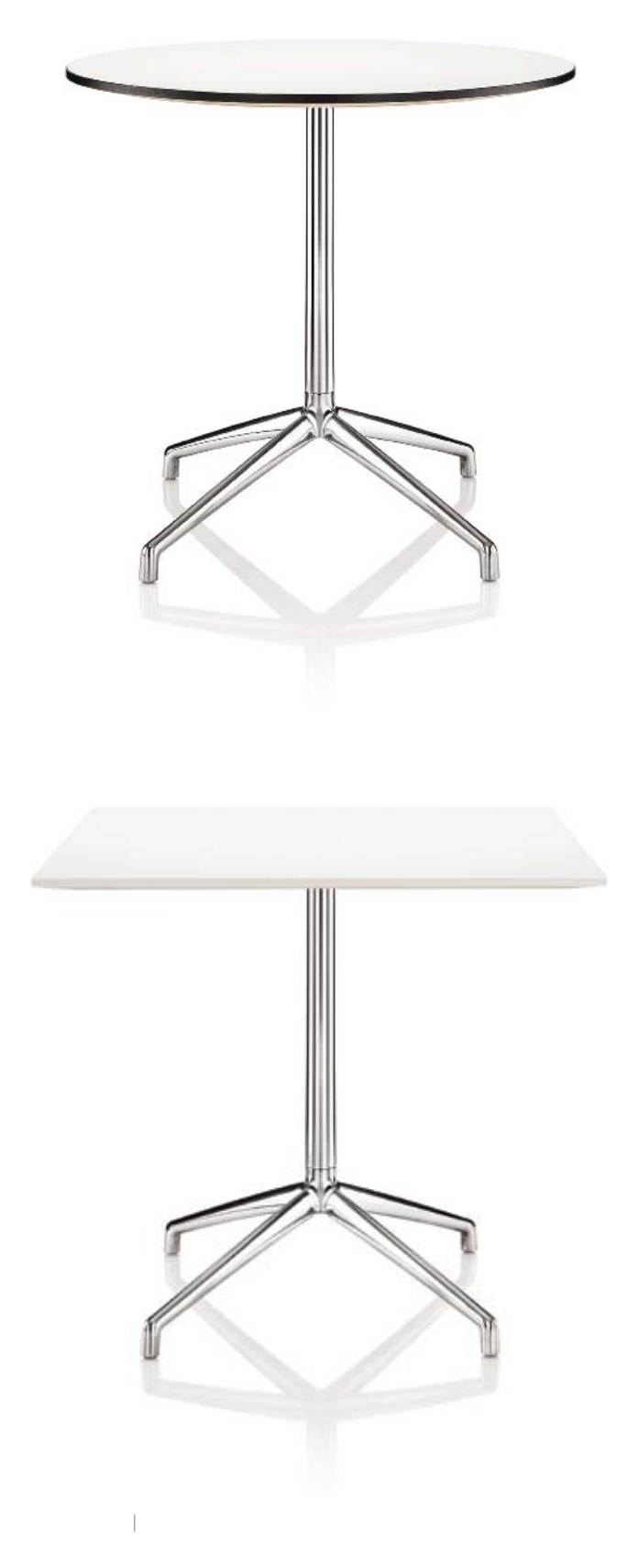
Our standard sizes are 800mm diameter and 800mm square. We supply white laminate tops with either black, white or clear lacquered MDF edges.