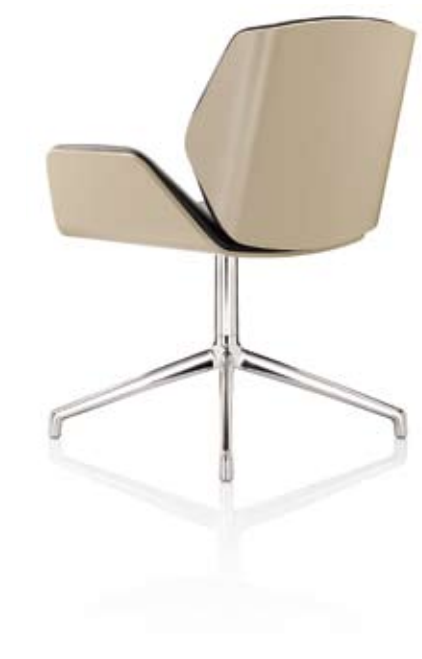
Satin polyurethane lacquer with leather interior

The success of the Kruze range is largely due to the versatility that it offers the specifier. Chairs and stools can be supplied in any combination of fabrics,