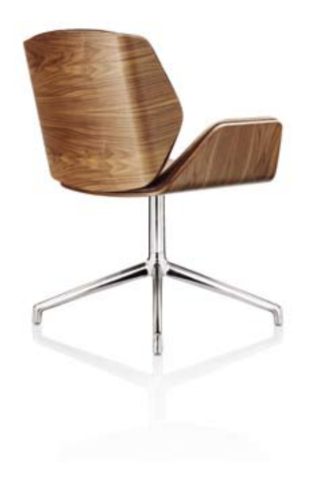
Black american walnut veneer with leather interior