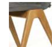
Solid Oak base as standard.