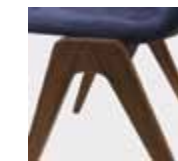
Solid Walnut base on chair only as standard.