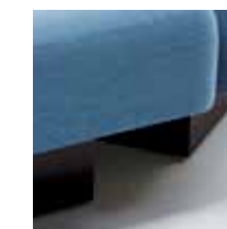
Plinth fascia in Black or White.