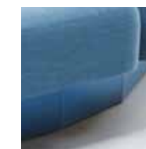
Plinth infill panel.