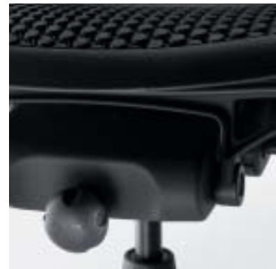
Smooth, balanced Harmonic tilt