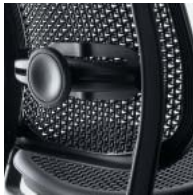
Cellular Suspension body support

Celle is uniquely suited to respond—to your shape, your motion, and the needs of your workplace. When you sit, its innovative Cellular Suspension™ provides immediate comfort and support. As you work, it flexes with your movements. Celle adjusts easily and rides fluidly for exceptional performance in a lower-cost work chair. Designed for application throughout a workplace, it complements interiors with thoughtful colors and a quiet look.