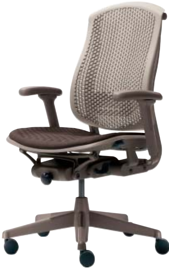
Celle Chair with Upholstered Seat

Jerome Caruso designed Celle chairs to be used in workstations, private offices, conference rooms, team areas, or community spaces—in business, healthcare, and learning environments. With its Cellular Suspension, trim lines, and color choices, Celle blends with a spectrum of surroundings. For an alternative look, the Latitude™ upholstery option adds a little foam-free padding without adding bulk.