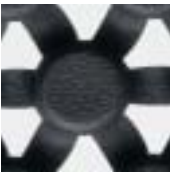
Cell and loops