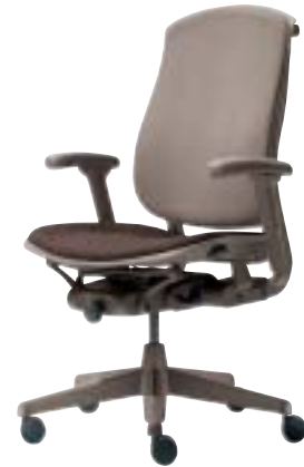
Celle Chair with Upholstered Seat and Back Option