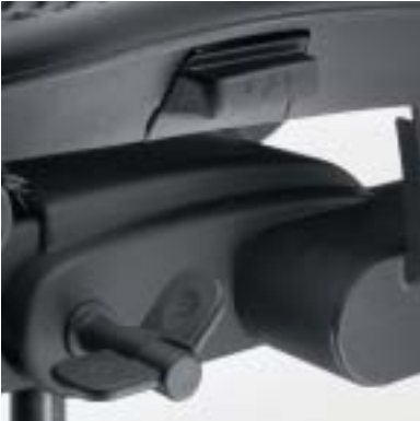
Full range of adjustments